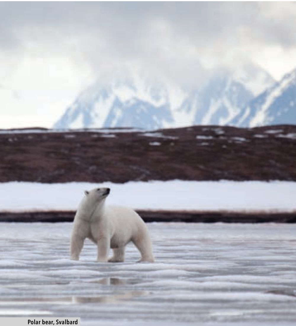
Polar bear, Svalbard

Norway's magical lands at sea, including Spitsbergen