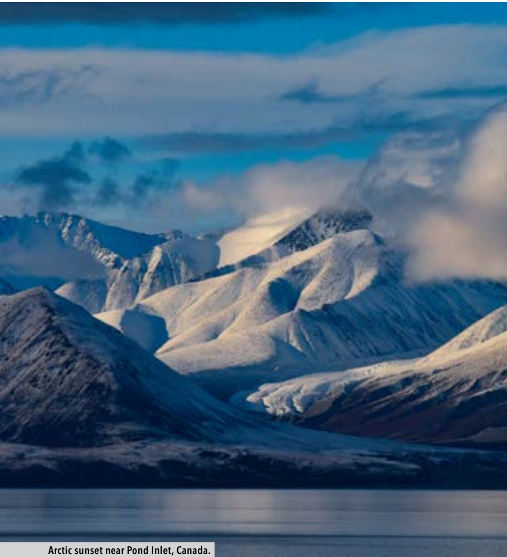
Arctic sunset near Pond Inlet, Canada.

Follow in the footsteps of early Norse explorers