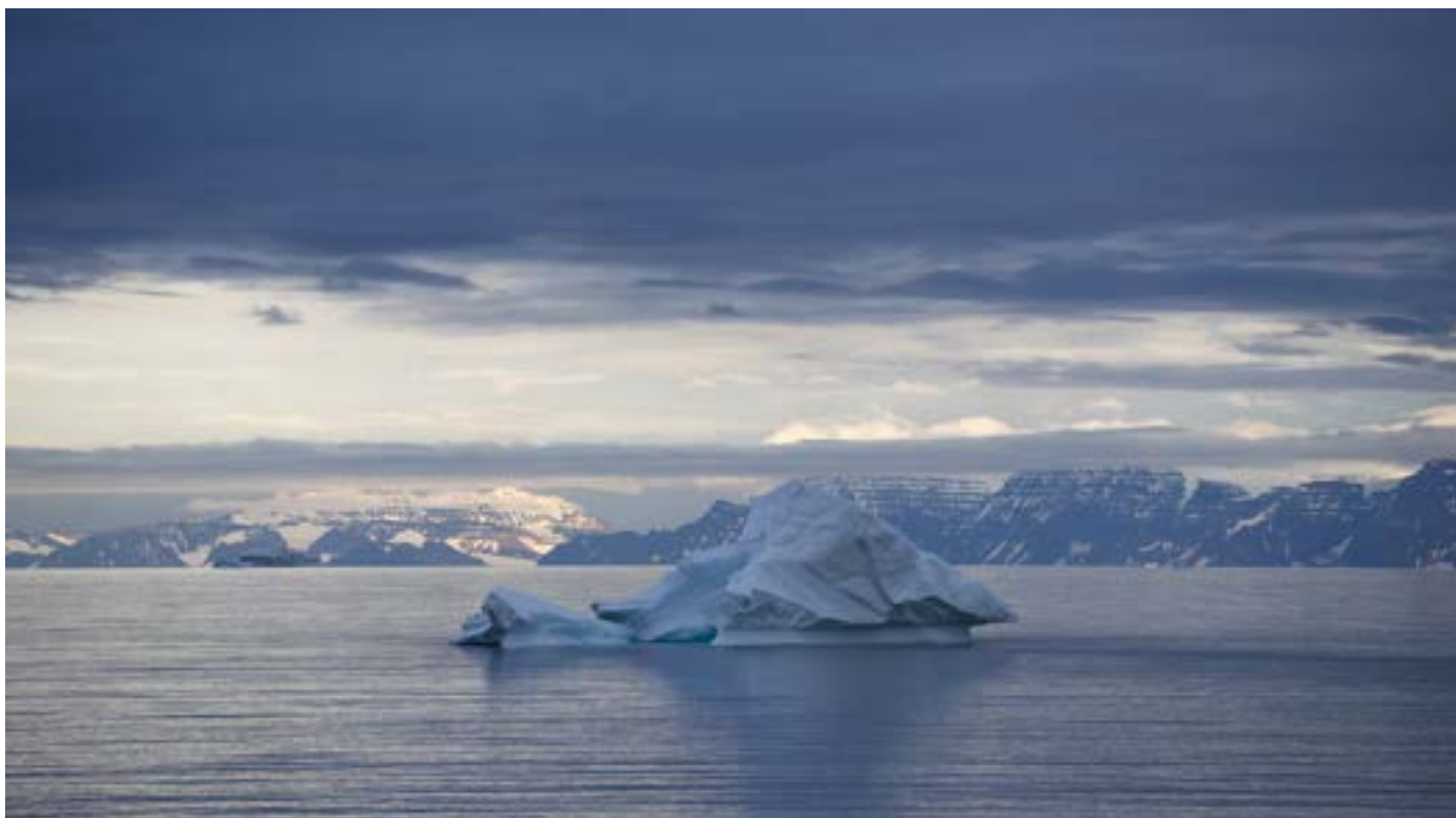
Hekla Havn, Scoresby Sound, Greenland.